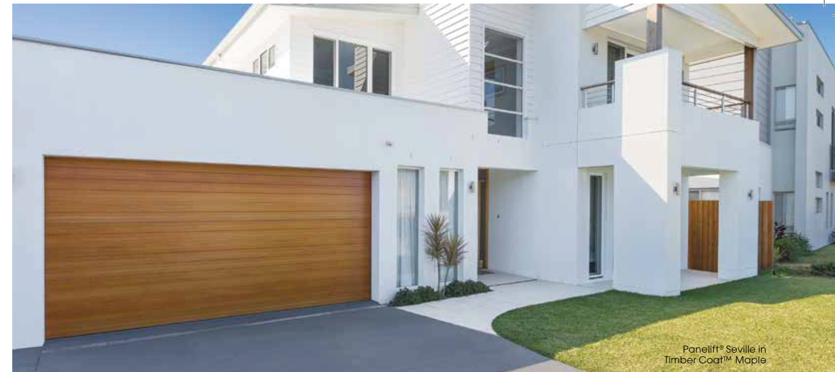
Panelift® Seville in Timber Coat™ Maple